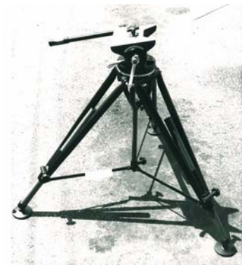
TP-9 WITH TP-9 PAN/TILT